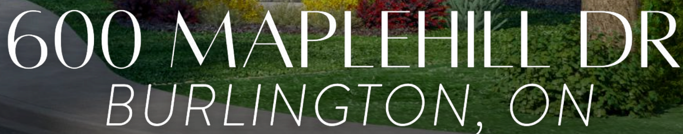
IMAGE DOES NOT REPRESENT THE FINISHED PRODUCT OR LAYOUT FOR THIS PROPERTY