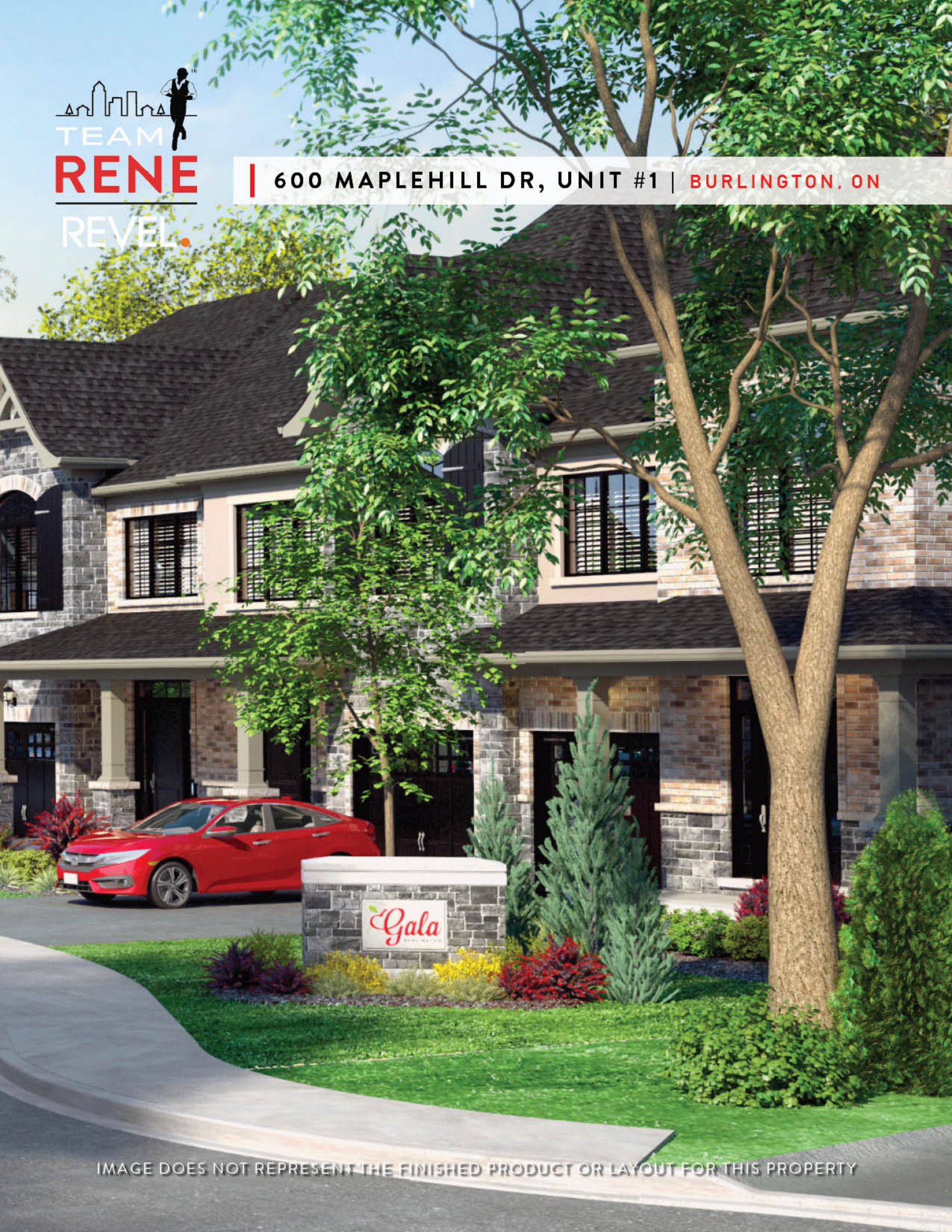
IMAGE DOES NOT REPRESENT THE FINISHED PRODUCT OR LAYOUT FOR THIS PROPERTY

| 600 MAPLEHILL DR, UNIT #1 | BURLINGTON, ON