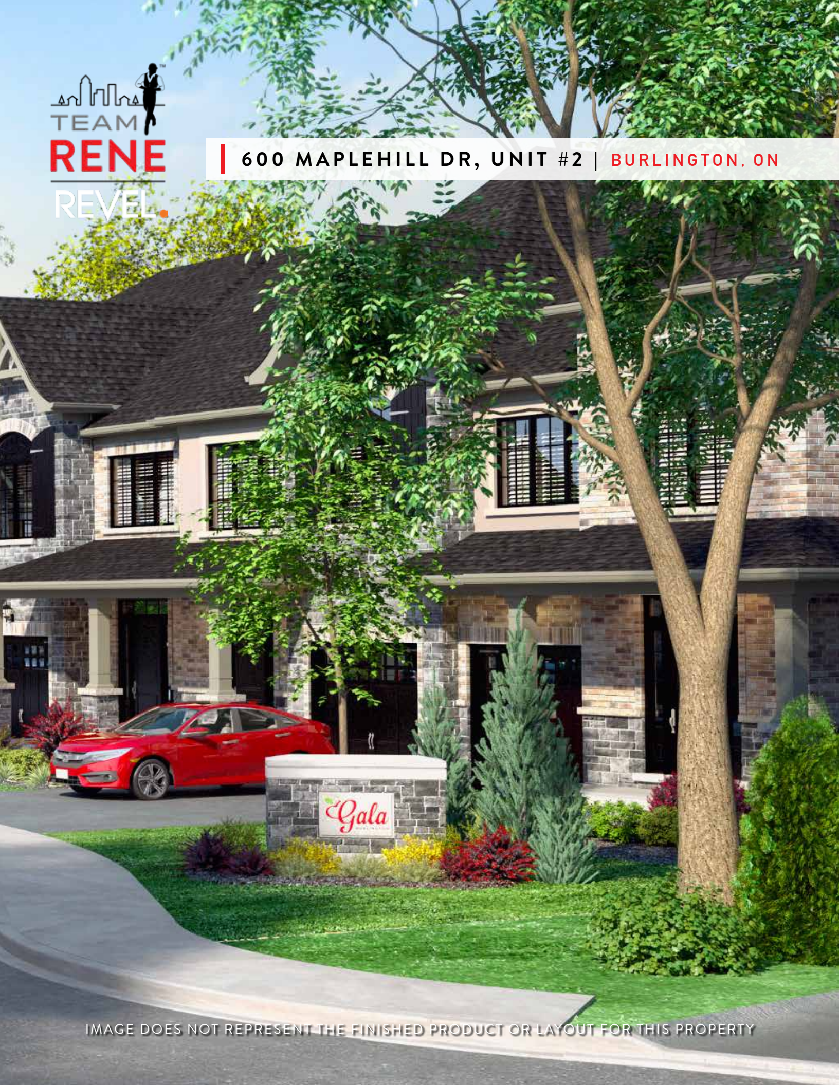
IMAGE DOES NOT REPRESENT THE FINISHED PRODUCT OR LAYOUT FOR THIS PROPERTY

| 600 MAPLEHILL DR, UNIT #2 | BURLINGTON, ON