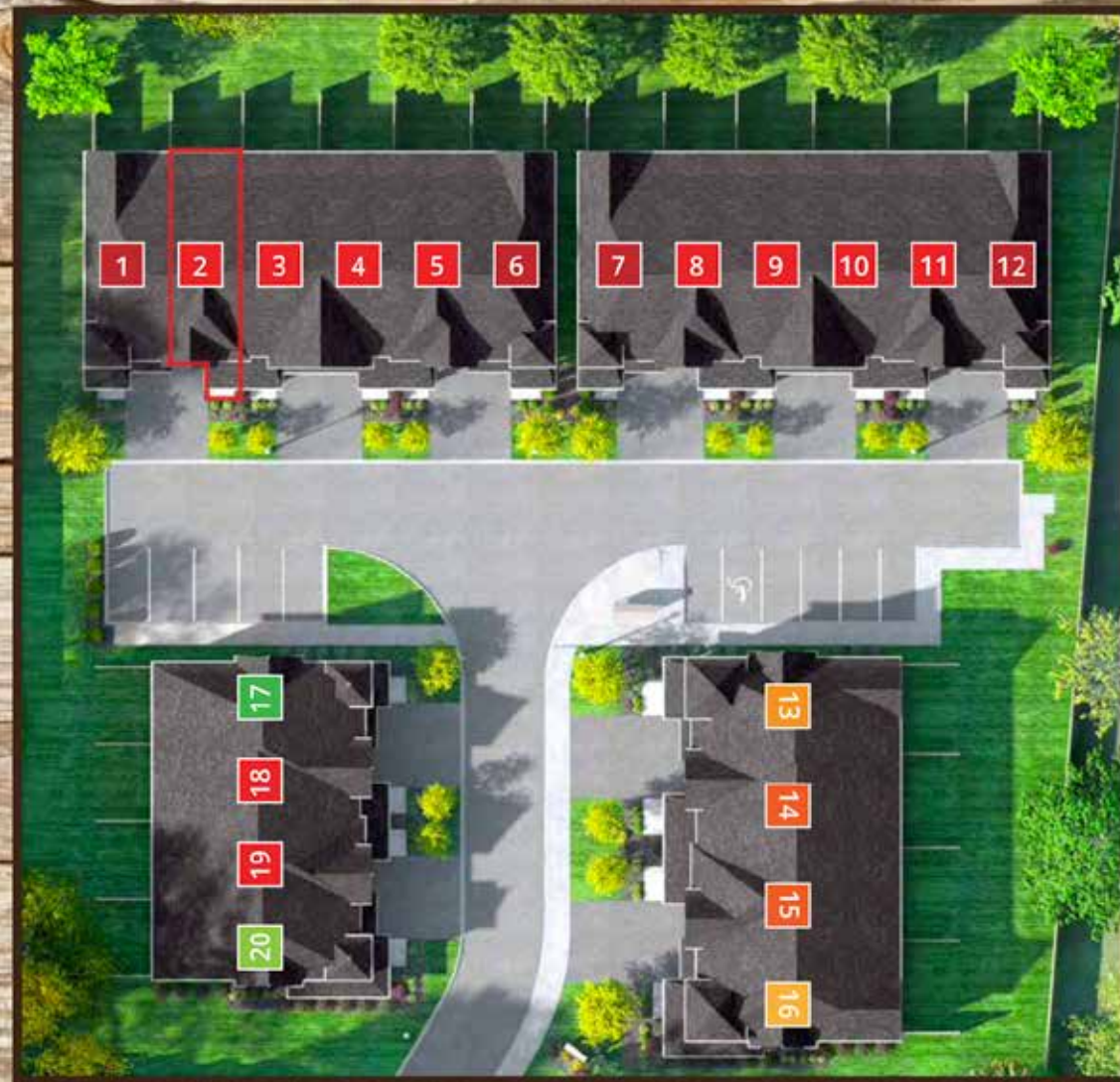
DiCarlo All renderings are artist's concept. Materials, sizes and specifications are subject to change without notice. All floorplans are approximate dimensions. Actual usable space may vary from the stated floor area. Exterior colours, grading, landscaping, windows, garage and entry doors may vary from the renderings. All Schedule B's attached to the legal agreement supercede these artist's renderings. E&OE